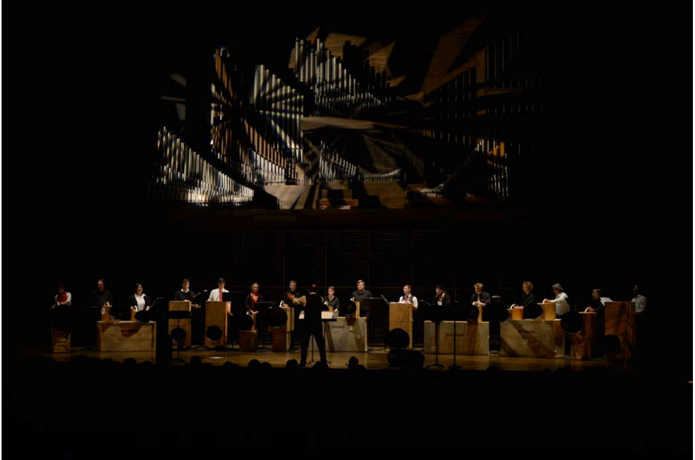
Intonarumori , performance view at The Cleveland Museum of Art, Gartner Auditorium, January 2015

“Even compared with other new music performances this was a colorful affair, with 16 music teachers, students, musicologists and enthusiasts cranking wooden boxes and pulling levers that would vary their pitch and sound. Producing noises that ranged from drones to whirrs, clicks, rattles and some rather rude sounds, and complemented by the spoken voice and a megaphone, this was as much performance art as a musical recital. Chessa was a star. Even though the sound poems he performed were in Italian, rhythm and musicality totally captivated the sizeable audience. In Filippo Tommaso Marinetti’s Bombardamento Di Adrianopoli , the sounds of war that he reproduced evoked as much excitement as any war movie soundtrack.”