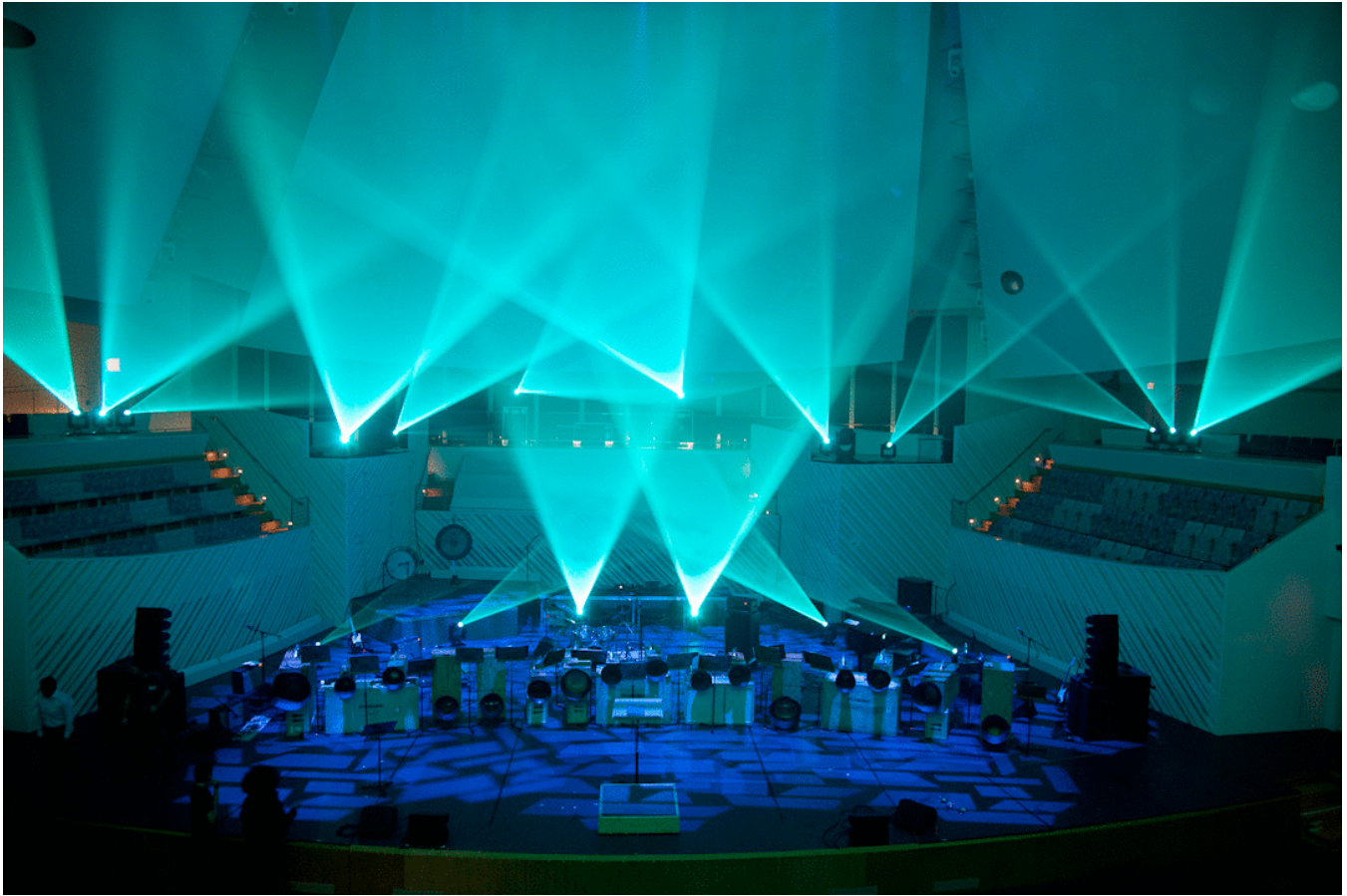
Intonarumori, ArtBasel Miami Beach, 2011