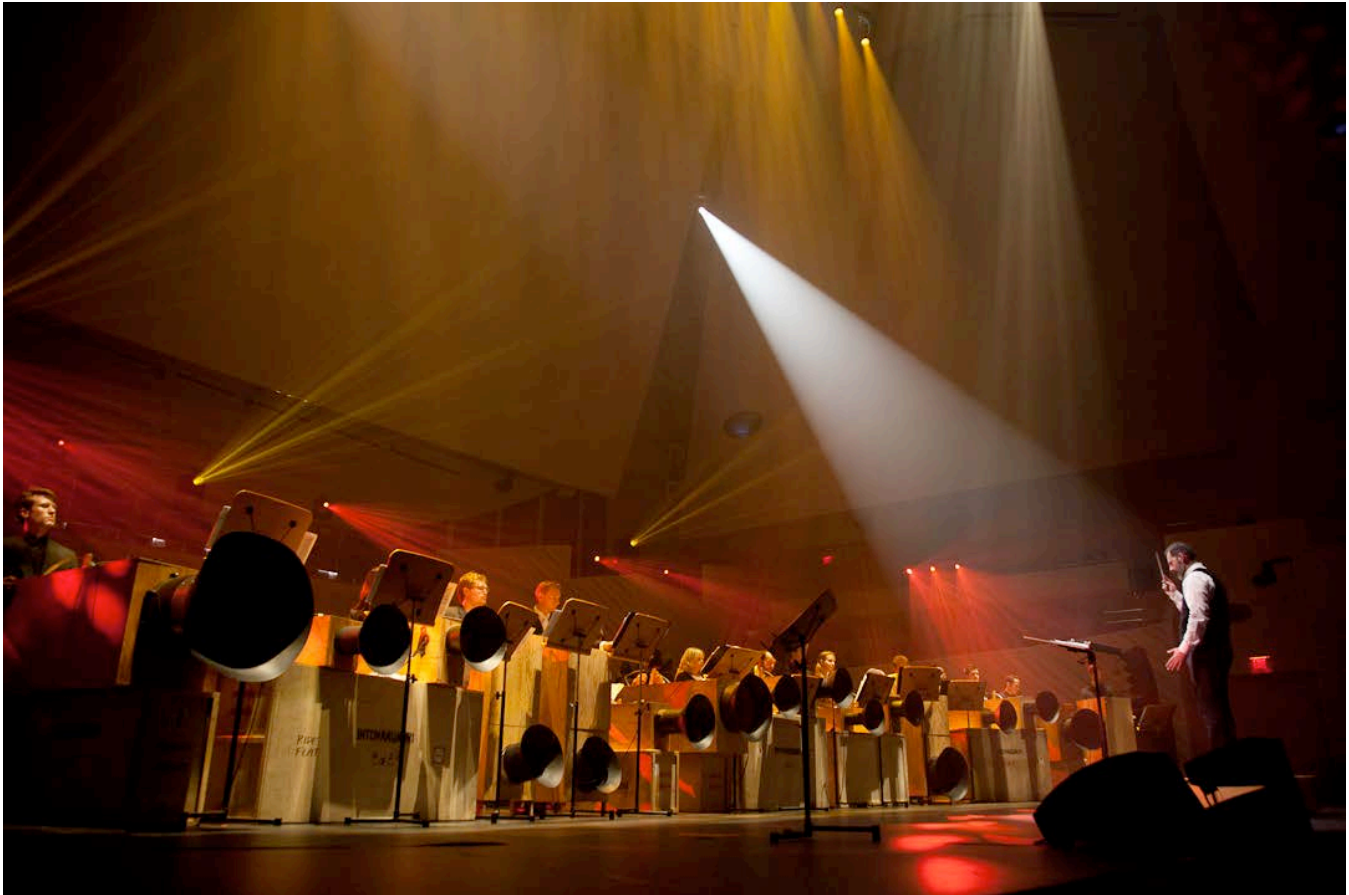
Intonarumori, ArtBasel Miami Beach, 2011