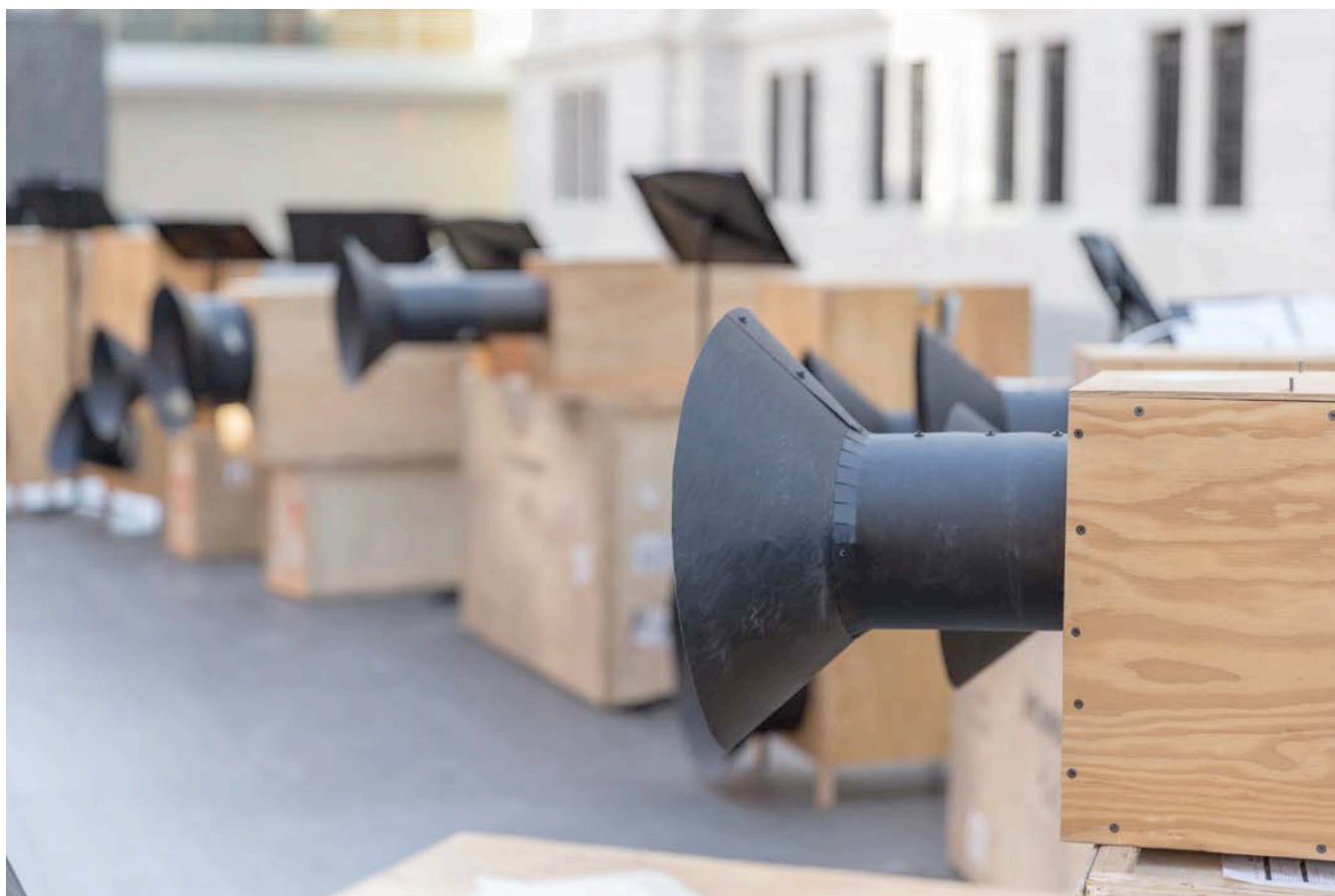
Intonarumori , installation view at The Cleveland Museum of Art, January 2015